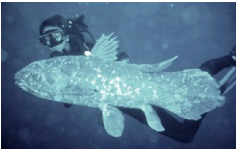
The coelacanth is one of science's most startling discoveries. So ancient that it was considered a candidate for the first fish that supposedly crawled onto land, it was long considered extinct until found in a fisherman's net in 1938 (Source: Smithsonian National Museum of Natural History).

“The biggest tree towers 180 feet with a 10-foot girth, indicating that it is at least 150 years old. The