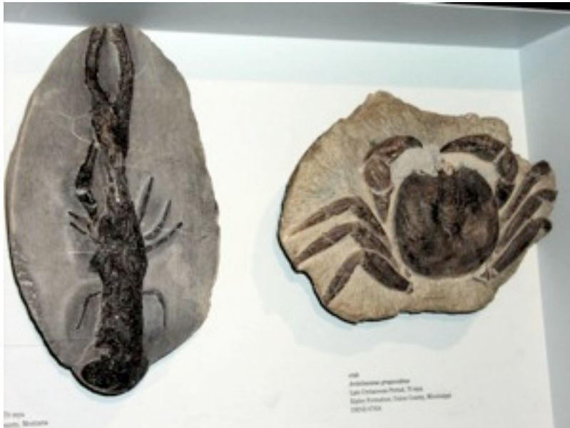
If evolution were true, why do we see so many species in the fossil record that remain unchanged for millions of years and are virtually unchanged from species we see alive today like this fossilized lobster and this crab.

Following is information about a few of these living fossils that either have not changed in time or were supposed to be extinct.