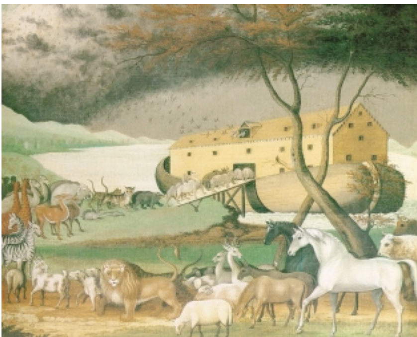
Into the Ark two by two. This portrayal of the loading of Noah's Ark is by 19th century American artist, Edward Hicks.

most of them, at least in any kind of concerted manner. Indeed, there never before has been a modern systematic evaluation of the alleged difficulties surrounding Noah's Ark. My recent book, Noah's Ark: A Feasibility Study (available at the ICR online book-