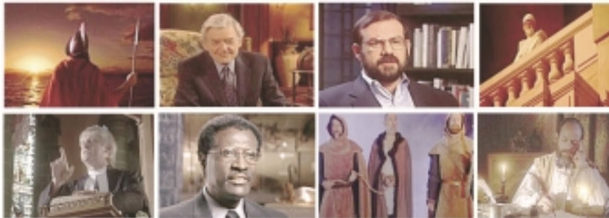
Scenes from The Seventh Day: Revelations from the Lost Pages of History

A Multicultural Tool For Worldwide Evangelism and Sabbath Enrichment Tracing the History of the Sabbath From Eden to Eternity