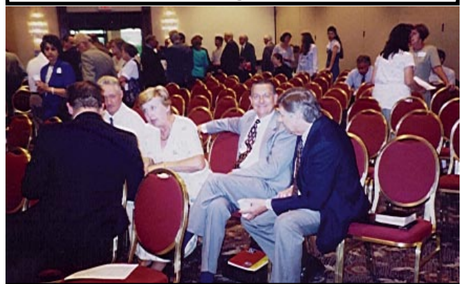
Break-time at the Conference—just a few of those in attendance!